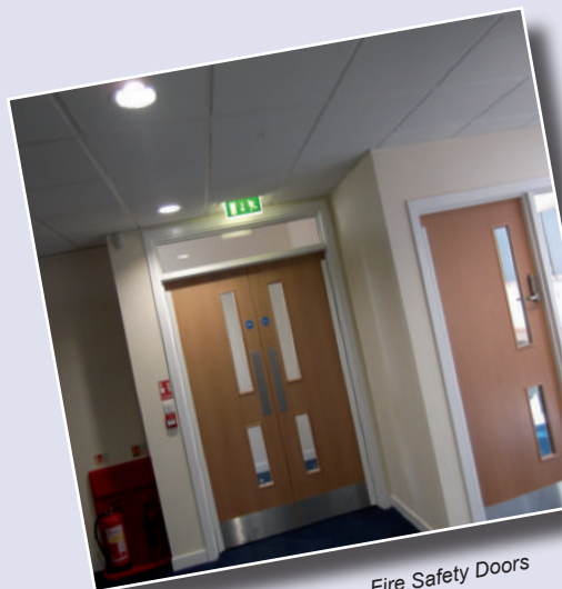
Fire Safety Doors