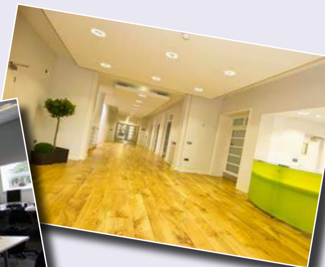
Entrance Hall (After)

Wadys work closely with SDC Special Projects on a number of projects and in 2011 they commissioned Wadys to merge two Harpur Trust schools in Bedford to form Bedford Girls School.