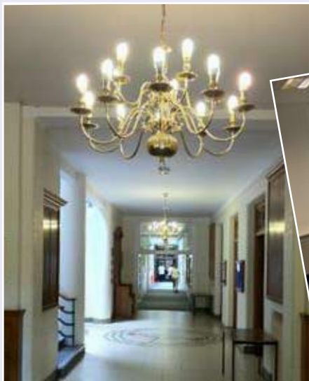
Entrance Hall (Before)