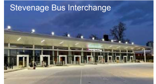
Stevenage Bus Interchange